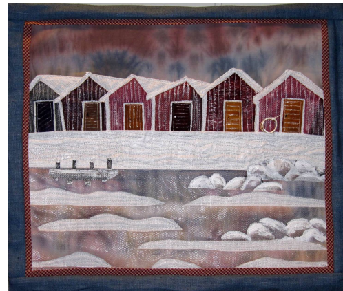
December 6 - Finland Independence Day "Havet vilar" by Gunhild Mäkinen