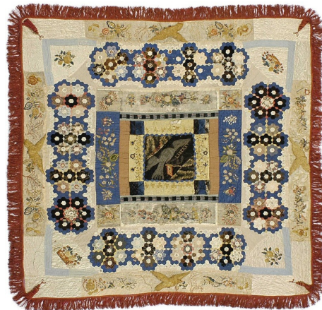
December 2 - International Day for the Abolition of Slavery A quilt made by Elizabeth Keckley, a woman born into slavery who became a distinguished writer and seamstress to Mary Todd Lincoln.