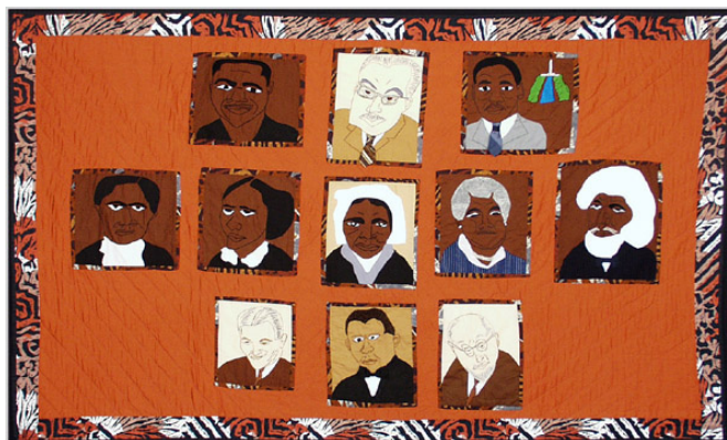
December 10 - Human Rights Day - "View from the Mountain Top" by Beverly Ann White See http://museum.msu.edu/museum/tes/quiltshumanrights/QHR%201.htm