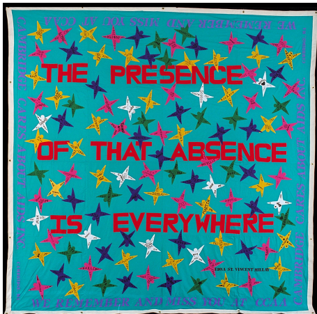
December 1 - World AIDS Day An AIDS Quilt Block made by Cambridge Cares

Tired of Santa? Here are some quilts commemorating or celebrating other December holidays.