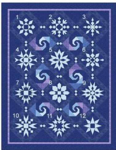
December 21 - Winter Solstice "Tyrol Pattern" by Arlene Lane