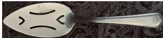
Lost and Found

This serving utensil was left behind at our Christmas Social. Please let me know if it is yours.